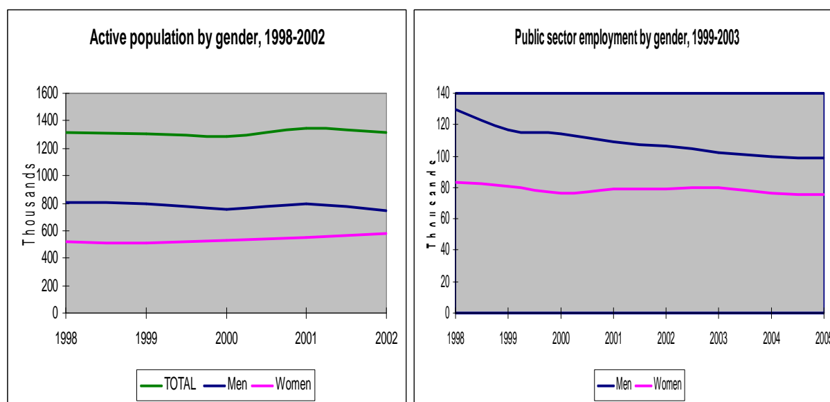
Figure 1: Albanian labor market trends

Albania is a particularly interesting setting where to study the impact of migration on domestic (formal and informal) labor market by gender. This country has been largely affected by the passage on the market economy at the beginning of 1990 and key changes over the process have occurred in the local labor market. Like in many other transition economies, the country experienced a substantial decline and stagnation in labor force participation in the new labor market. Public sector employment has declined enormously during the transition period but job growth in the private sector has been too slow to compensate (see Figure 1).