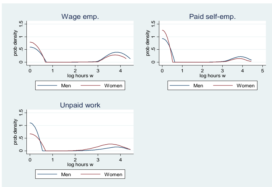
Figure 3. Hours of work distribution, by type of work and gender

28%, whilst if they experienced migration either directly or through another household member the gender employment gap is respectively 22% and 16%. In case of past migration of others, though, employment rates decrease both for males and females, suggesting that those who stay behind are either more likely or more willing to withdraw from the labor market (men relatively more than women). Moreover, the paid plus unpaid employment rate decreases in all cases but for return migrants: women upon return are significantly less engaged in unpaid work and more in paid employment (this sub-group is very small, though).